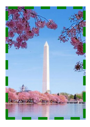
Cherry blossom time in Washington D.C.

In NYC, the group will go up the Empire State building, visit the 9-11 memorial, see a Broadway show, go to Ellis Island, and have a chance to sample lots of yummy food!