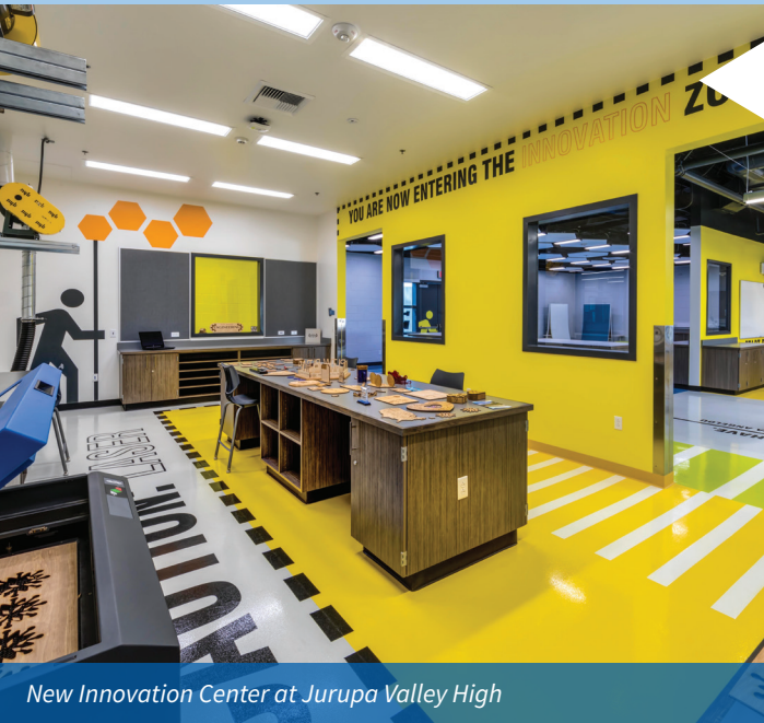
New Innovation Center at Jurupa Valley High