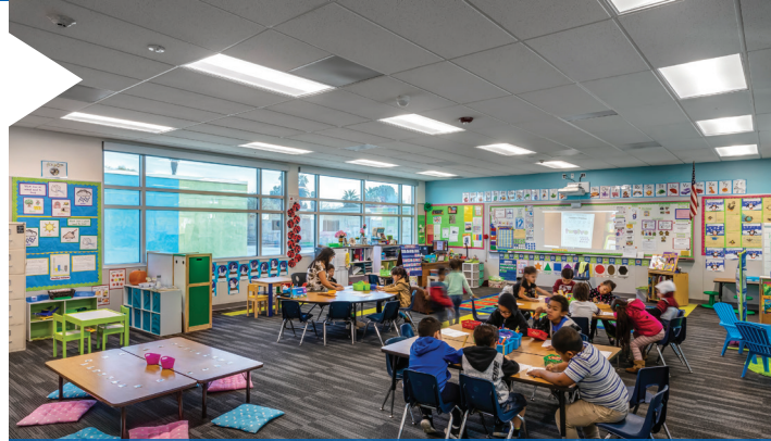
Updated classroom with new lighting, paint and flooring at Ina Arbuckle Elementary