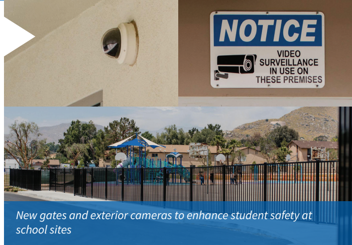
New gates and exterior cameras to enhance student safety at school sites