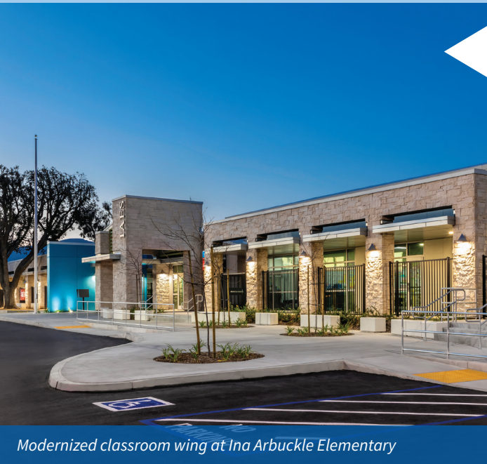
Modernized classroom wing at Ina Arbuckle Elementary