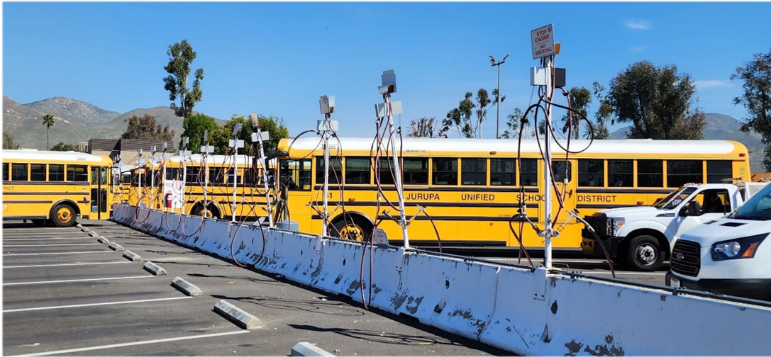
Jurupa Unified SD's current time fill fueling area.