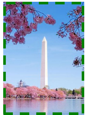
Cherry blossom time in Washington D.C.

In NYC, the group will go up the Empire State building, visit the 9-11 memorial, see a Broadway show, go to Ellis Island, and have a chance to sample lots of yummy food!