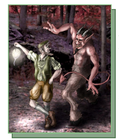
Jack O' the Lantern

You may be wondering how the tradition of Trick or Treating got started. There are many theories, but probably this tradition also comes from the ancient Celts who left food and wine outside their doors on this mystical night so the wandering spirits would not invade their homes.